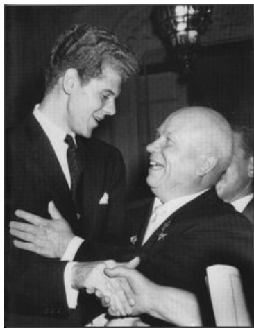
Van Cliburn with Premier Nikita Khrushchev

On March 19, WRR presents a live call-in radio show to celebrate the 50th Anniversary of Van Cliburn winning the 1958 Tchaikovsky Competition. This special broadcast is part of a series of programs celebrating the accomplishments of one of Texas' favorite sons, the international sensation and musical legend that is Van Cliburn.