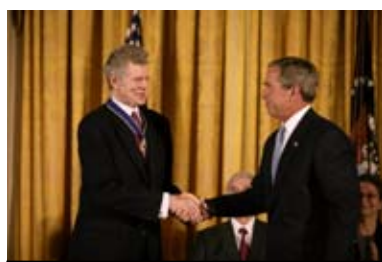
Van Cliburn receives Medal of Freedom from President George W. Bush

Stay tuned to WRR for additional Van Cliburn programming.