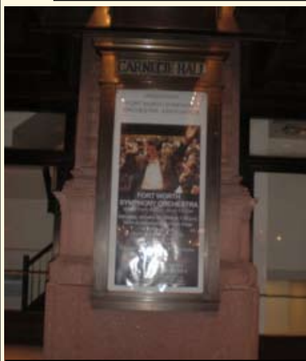
The Marquee from Carnegie Hall highlights the Fort Worth Symphony's visit.