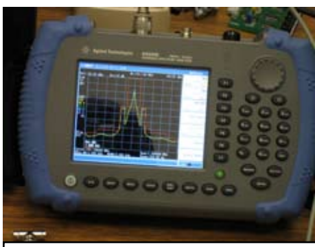
Agilent Technologies Prototype Hand-held Spectrum Analyzer