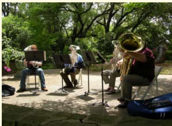
The Dallas Wind Symphony's Tuba Quartet performs during WRR's inaugural Earth Day at the Texas Discovery Garden's.