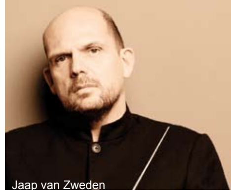
Jaap van Zweden

WRR will present a live broadcast from Napa Valley's Festival del Sole in July! Visit wrr101.com to learn how to experience this performance.