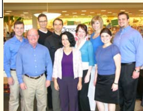
Members of the Fort Worth Opera during a Meet and Greet at Barnes & Noble Southlake.