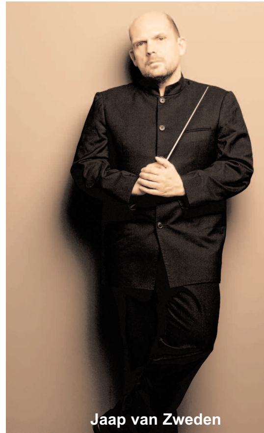
Jaap van Zweden

But I must confess that I most anticipate the three history-making weeks Jaap van Zweden will be at the podium; his first appearances as our music director designate. Maestro van Zweden will conduct two weeks of the DSO's Texas Instruments Classical Series Beethoven Festival this fall and will return in the spring to conduct the Dallas Symphony Orchestra and the world-renowned Dallas Symphony Chorus in the stunning Verdi Requiem; these are moments you simply will not want to miss.