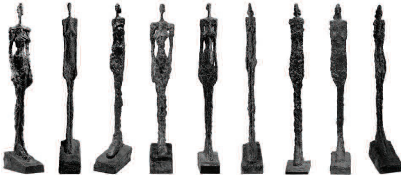
Women of Venice I - IX.

Imagine the excitement of nine women reuniting for the first time in more than four decades.