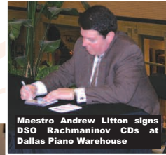
Maestro Andrew Litton signs DSO Rachmaninov CDs at Dallas Piano Warehouse

Photos from recent WRR Classical 101.1 FM events