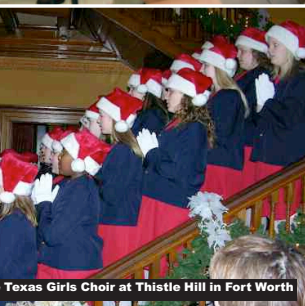
The Texas Girls Choir at Thistle Hill in Fort Worth