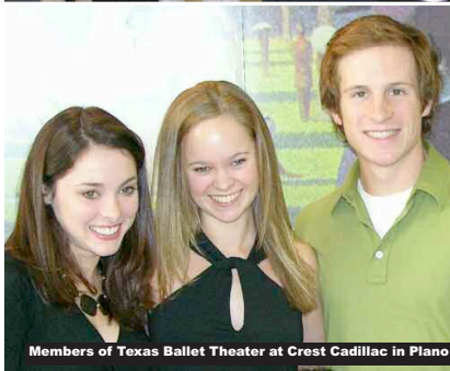
Members of Texas Ballet Theater at Crest Cadillac in Plano