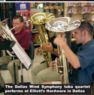
The Dallas Wind Symphony tuba quartet performs at Elliott's Hardware in Dallas