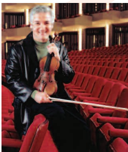
Pinchas Zukerman is among several of the DSO's guest "Mozart" performers