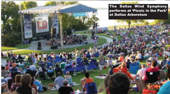
The Dallas Wind Symphony performs at 'Picnic in the Park' at Dallas Arboretum