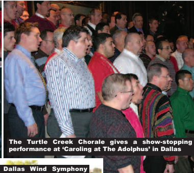
The Turtle Creek Chorale gives a show-stopping performance at 'Caroling at The Adolphus' in Dallas